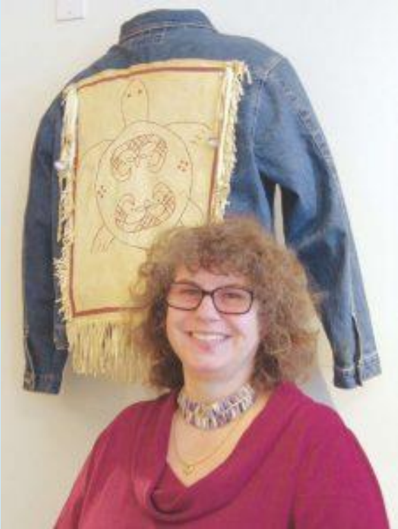
Painted Leather and Jean Jacket. 1990s