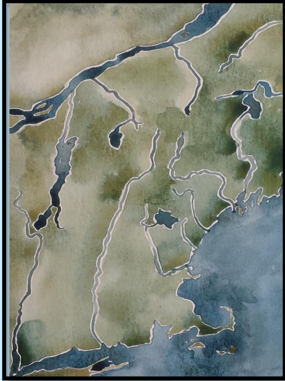
Aerial View of N'dakinna