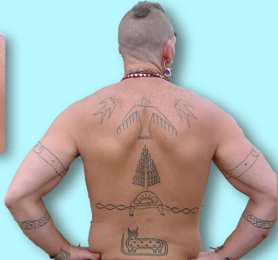
Tattoo Body Art. Image Courtesy of Melody Mackin.