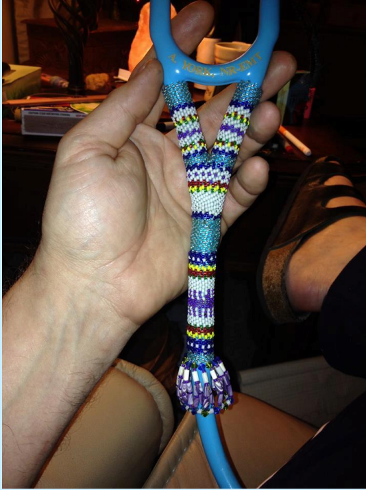
Beaded Stethoscope.