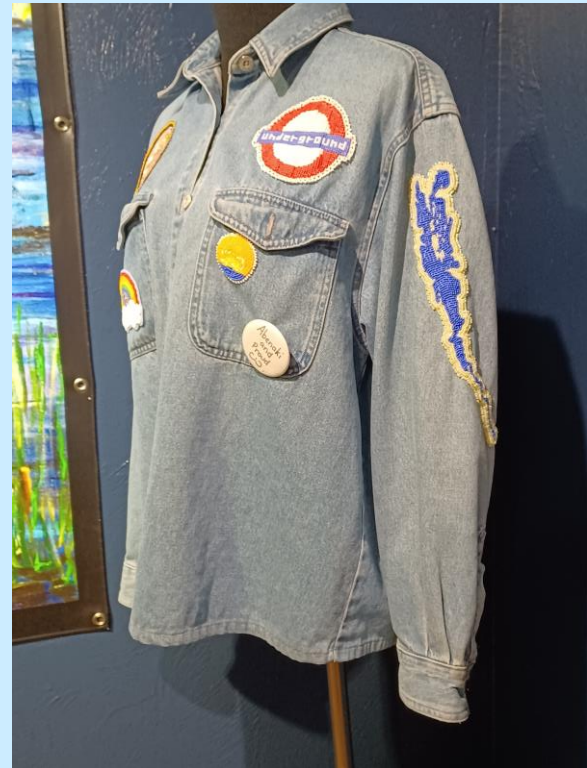
Beaded Jean Jacket.

Image Courtesy of Vermont Abenaki Artists Association