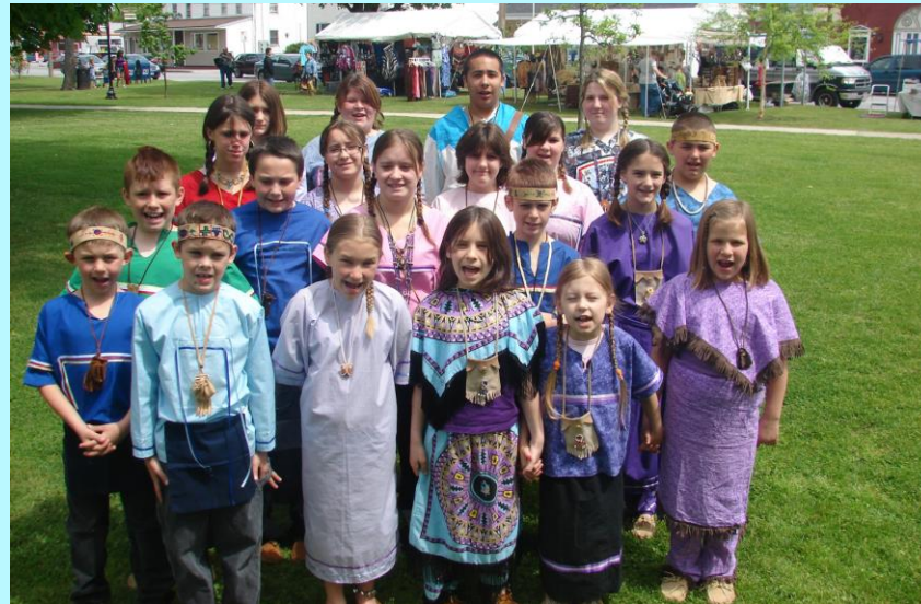
Circle of Courage Dancers.